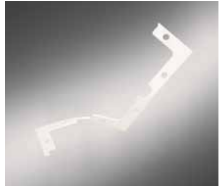
Excellent machinability due to high toughness.

The continuing reduction of component sizes in semiconductor production has placed increasing demands on materials of a new generation.