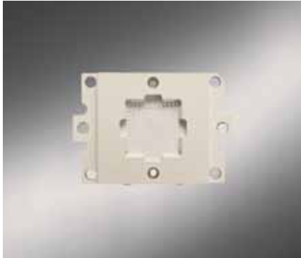
The finest structures can be realised in TECAPEEK CMF with very low burring.